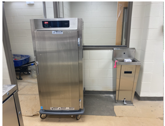
Kitchen equipment has been delivered and tied in