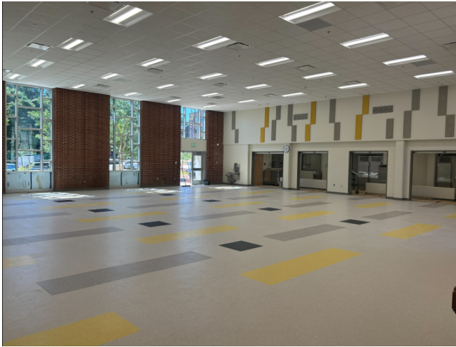
Cafeteria VCT install is complete