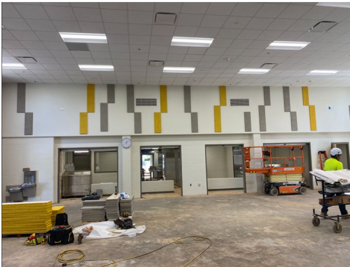
Acoustical sound panel install in the cafeteria is complete