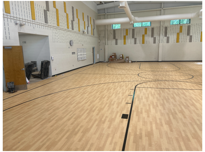
Gym floor and striping is complete